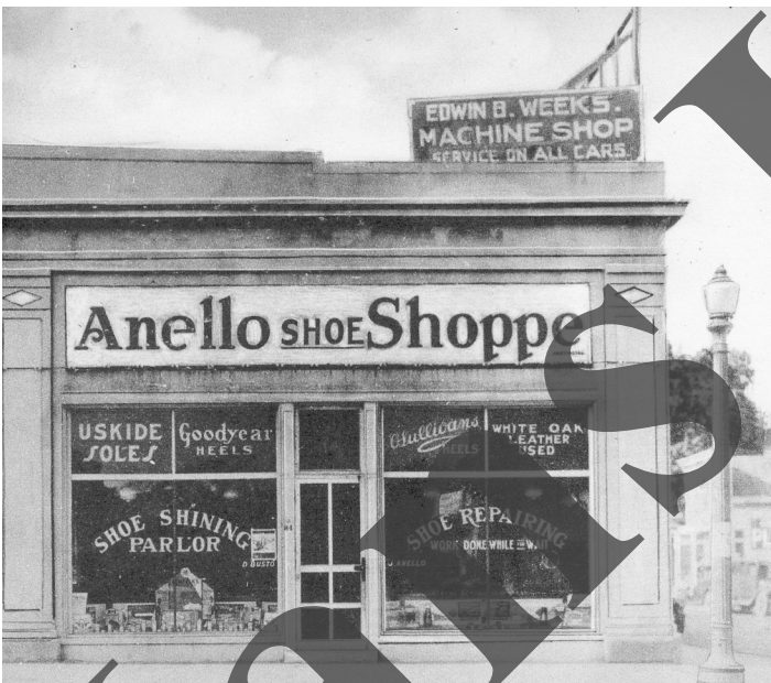
The Anello Shoe Shoppe, 84 West Main Street, stood on the south east corner of Main Street and Railroad Avenue in the 1920's.