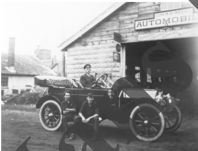
Cars are getting better, as this 1918 picture shows. Photo taken at Week's Garage in the Roe Court.