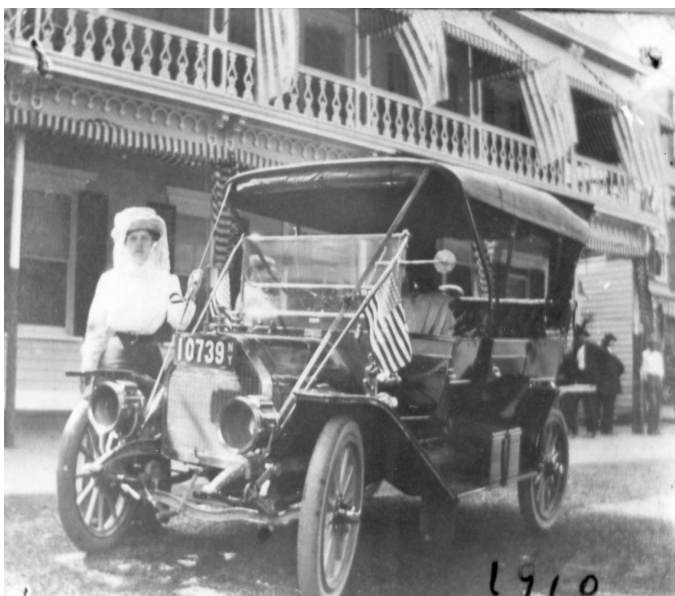
An unknown make automobile in front of Roe's Hotel, 1910.