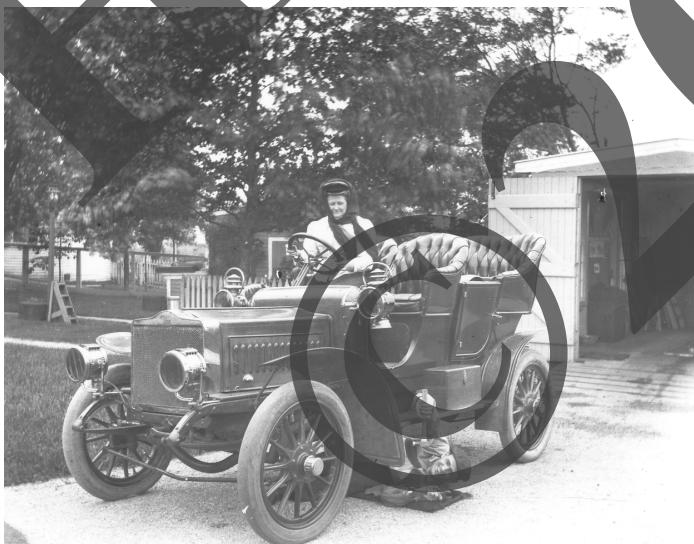
No need to raise the car to inspect it underneath, they were high enough of the ground to crawl under.