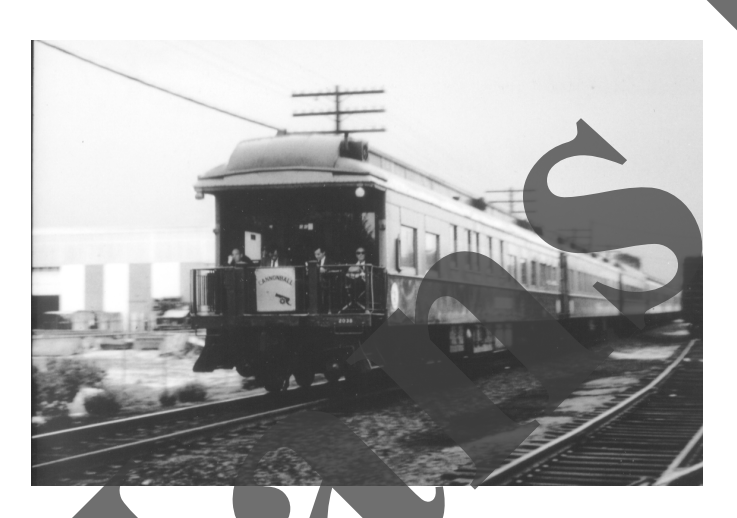
The 'Cannonball' train, 1967.

A Pennsylvania Railroad steam engine just east of the South Ocean Avenue railroad crossing in 1936. Steam engines are now much bigger and much more powerful than in the early years of the century. 1955 was the last year of steam engine service on the Long Island Railroad.