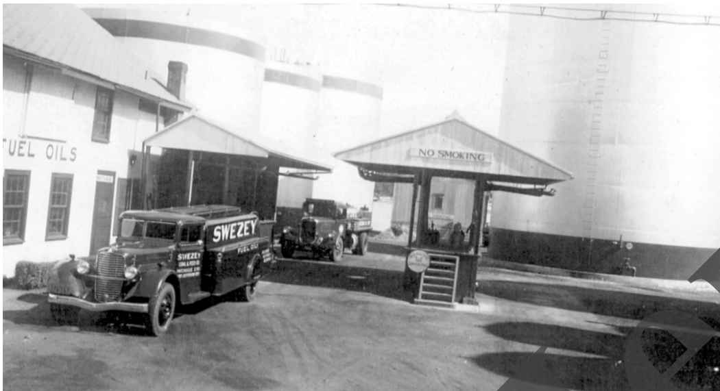
The loading platform of the Swezey Fuel Oil Company's river terminal. In this 1940's picture the loading platform was still close to the tanks. Safety regulations in later years required an increase of this distance.