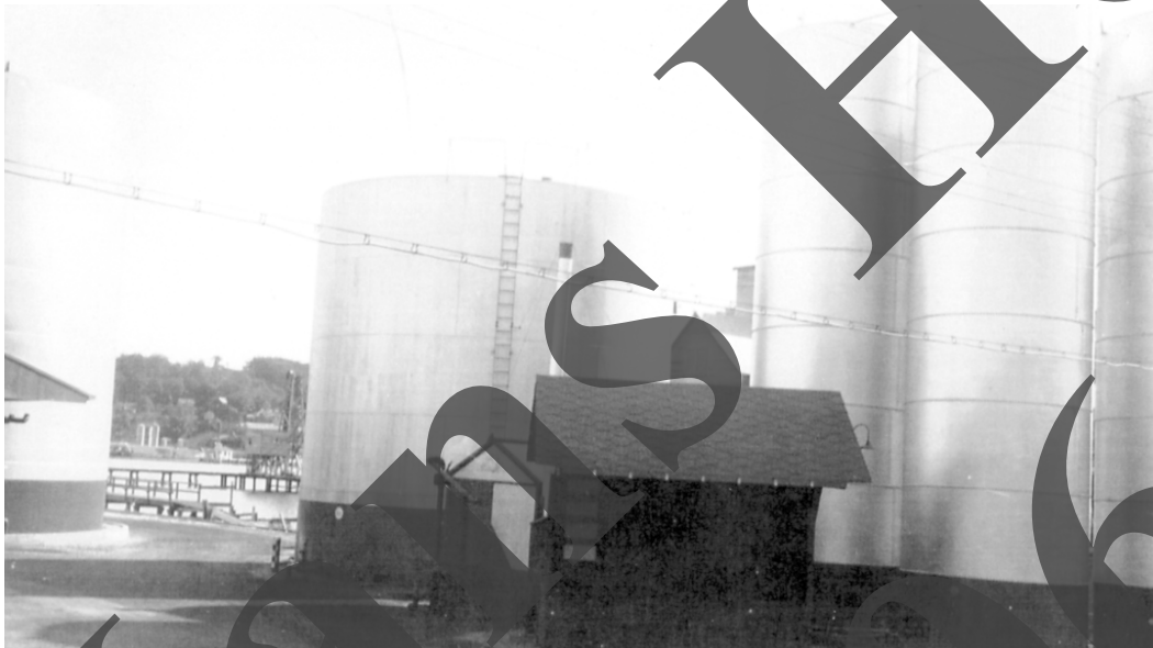
The Swezey oil terminal, 1940.