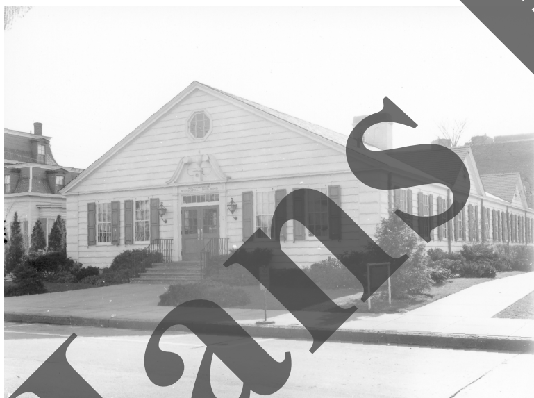
The Patchogue Village Municipal building on Baker Street. Originally TERA, the Temporary Emergency Relief Administration, built it for their own use on this village property, but it was turned over to the Village of Patchogue in 1935. The building to the left is the Jarvis Baker home, which was purchased by the village and housed the village departments prior to the acquisition of the TERA building. In 1946 this became the YMCA building, which was torn down in later years and the space became the Village Hall parking lot.