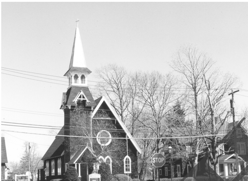
St. Paul Episcopal Church on Rider Avenue. This is Patchogue's oldest church building, built in 1883, of all wood construction with beautiful and unique interior features.