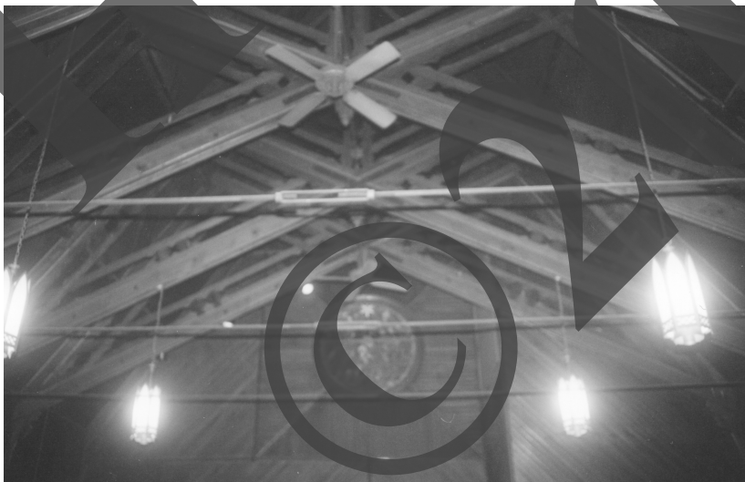
The unique construction of the ceiling beams and roof supports.