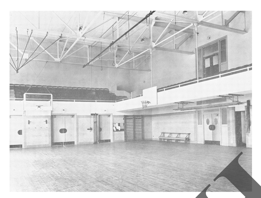
The gymnasium, 1930.