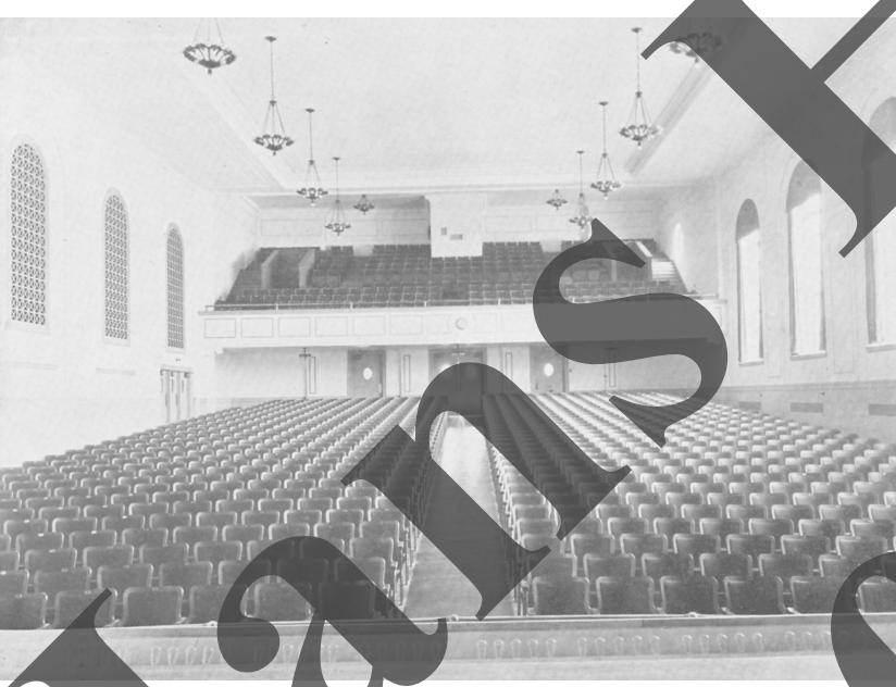
The high school auditorium in 1930.