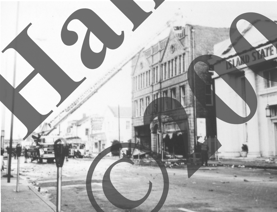
The Masonic Temple on West Main Street became a total loss due to a fire November 7, 1974. The site of this building was purchased by the Island State Bank.