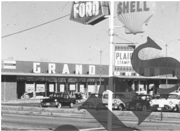
The Grand Union store opposite Rider Avenue.