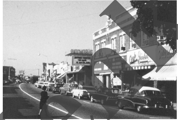
Street scenes on East Main Street, 1962.