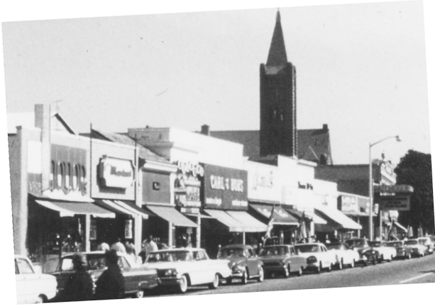
The north side of East Main Street.