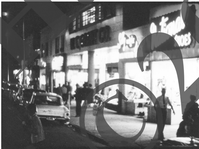
W.T. Grant store.