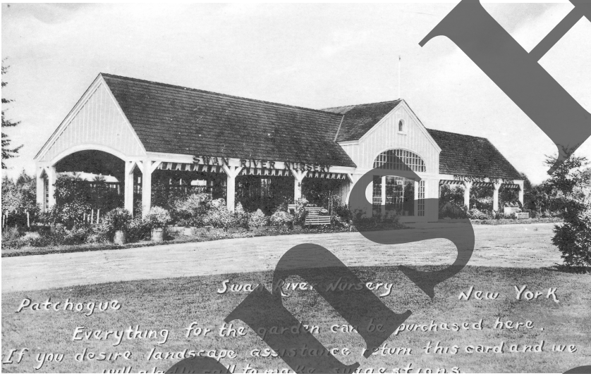
Patchogue Swan River Nursery New York Everything for the garden can be purchased here. If you desire landscape assistance, return this card and we will gladly call to make suggestions.

The Swan River Nursery was a large and well known nursery on Montauk Highway in East Patchogue. This nursery was started in 1893 by Charles W. Avery on the property of the Avery family, which owned this land since 1754. From this park-like nursery, products were shipped to all parts of the island and New York City.