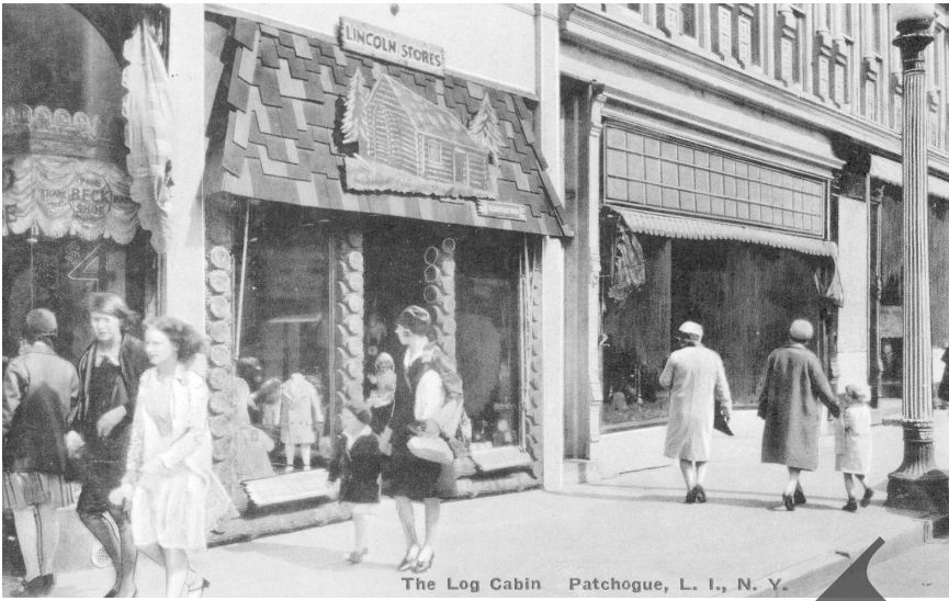
The Log Cabin Patchogue, L. I., N. Y.

The 'Log Cabin', a Lincoln store on South Ocean Avenue in the 1930's.