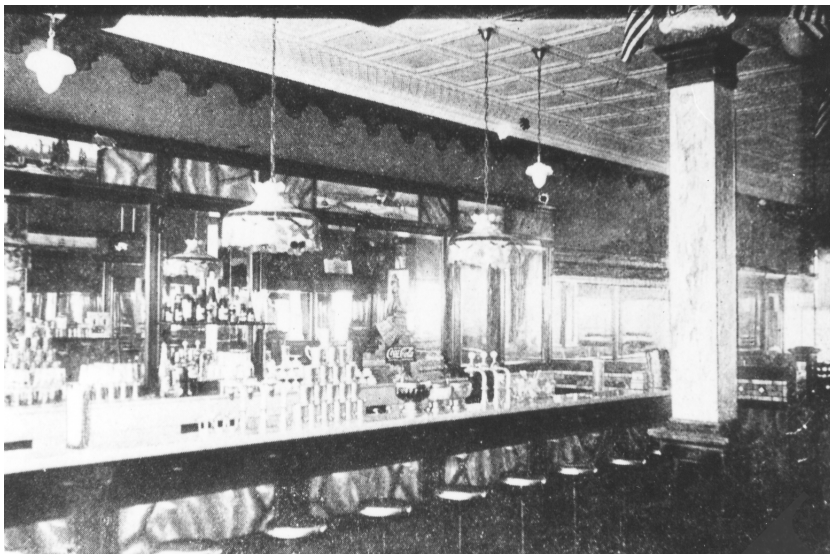
A 1917 picture of the Olympia Confectionary and Ice Cream Store at 32 South Ocean Avenue, a favored place, especially for young people. The store was in the old Ackerly building on the west side of the street, where today the entrance to the parking lot is located. Clarence Lagumis was the manager in 1926.