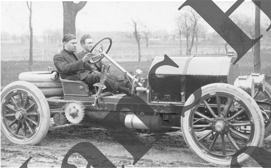
This is definitely a young fellow's car, just the bare essentials.