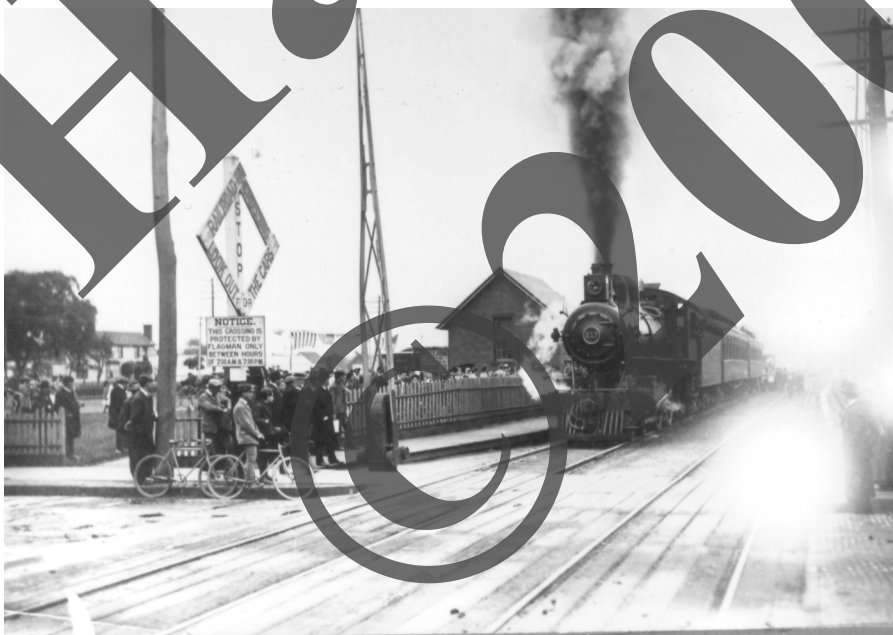
A train approaching the Ocean Avenue crossing c.1905. The switching tower had not been built at this time.