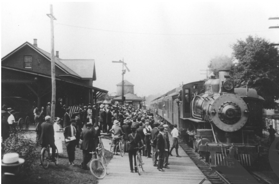
On a hot summer weekend the railroad station would become a very busy place.