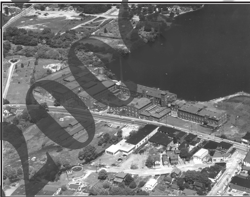
A beautiful aerial photo of the Lace Mill, taken by Jim Mooney July 4, 1960.

While the book Patchogue The Early Years dealt with the development of the mill up to the year 1918, this chapter shows the growth of the mill after 1918 and the gradual decline, which eventually led to the closure of the mill in 1954, the conversion of the mill to the Island Industrial Park, the big fire in 1972 and the slow deterioration of the remaining buildings. The demolition of the remaining buildings in 1983 paved the way for the construction of the new Swezey flagship store.