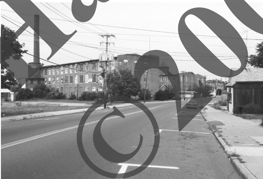
A July 1989 picture of the old Lace Mill. Vacant, vandalized and with the windows boarded.