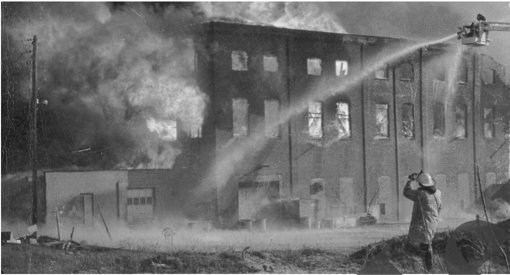
Firemen from 38 fire departments fought this blaze for over 29 hours to get the fire under control. Water from the lake had to be used to supplement the water available from the water system.