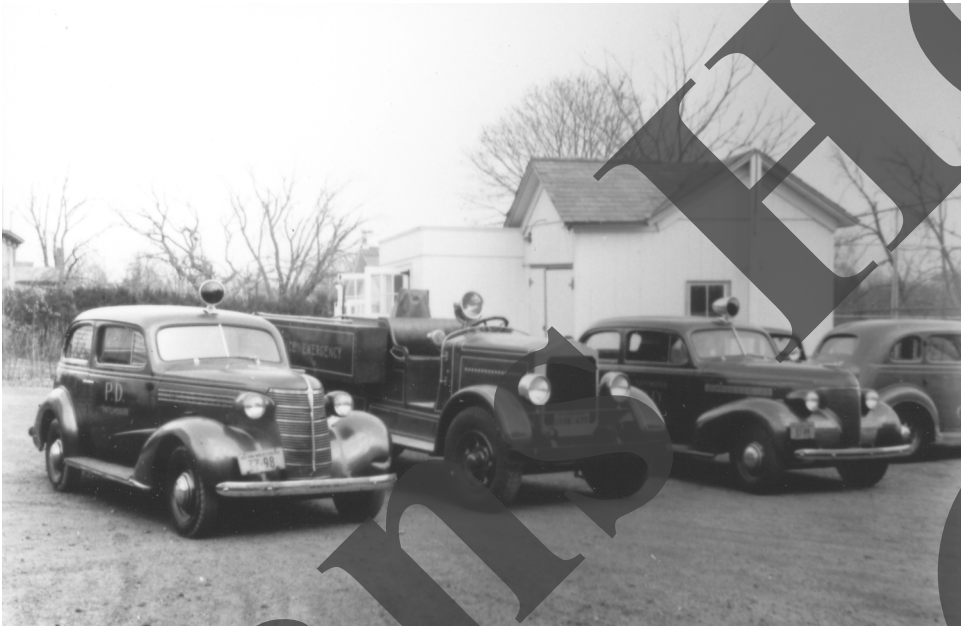
A 1940 line-up of Patchogue police vehicles in the Baker Street parking lot. The former fire truck was used to transport a boat for emergency water rescues.