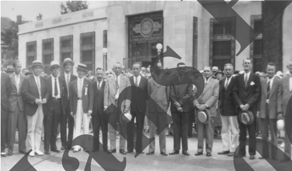
Dedication ceremony of the post office, August 31, 1933. The original photo of this group was an ultra-wide photo, but the format of this book allows only the center portion of the photograph to be shown.