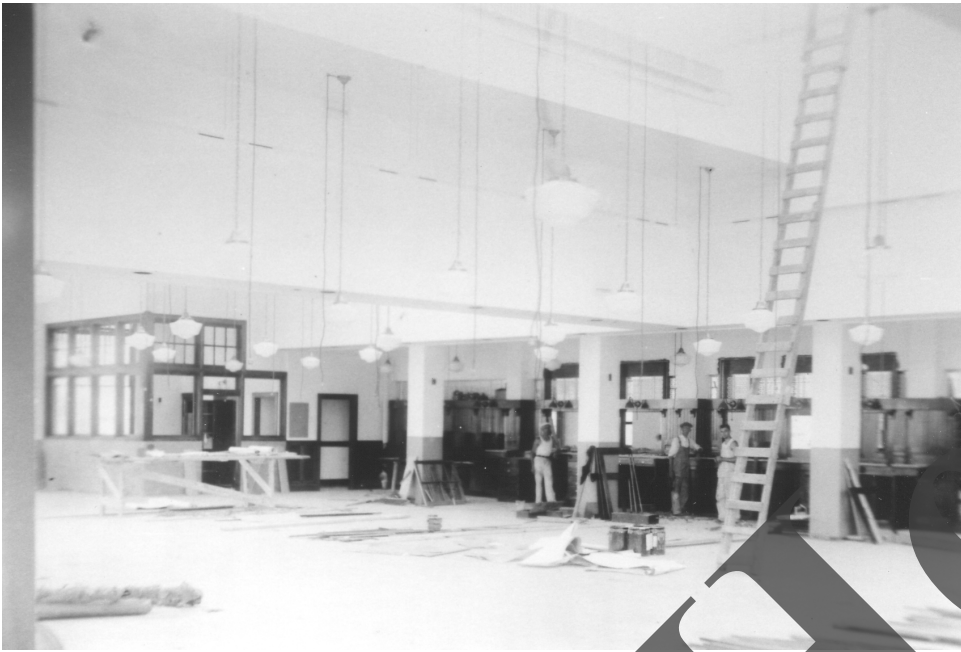
Work on the interior of the post office, August 1, 1933.