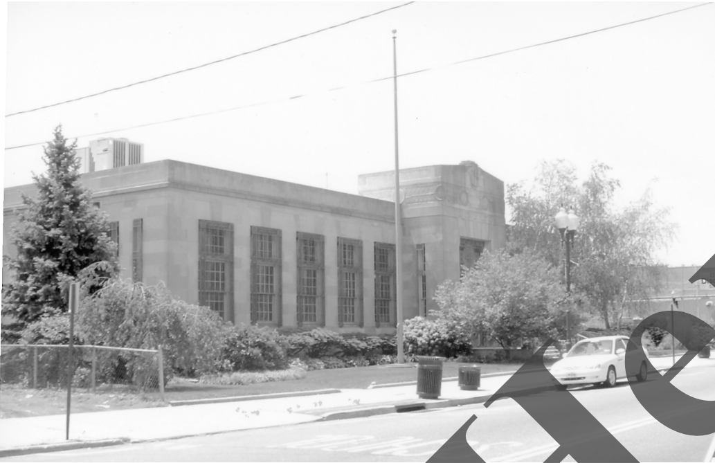
The Patchogue Post Office in 2006.