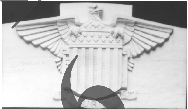
Four of the plaster models of the beautiful frieze above the entrance.