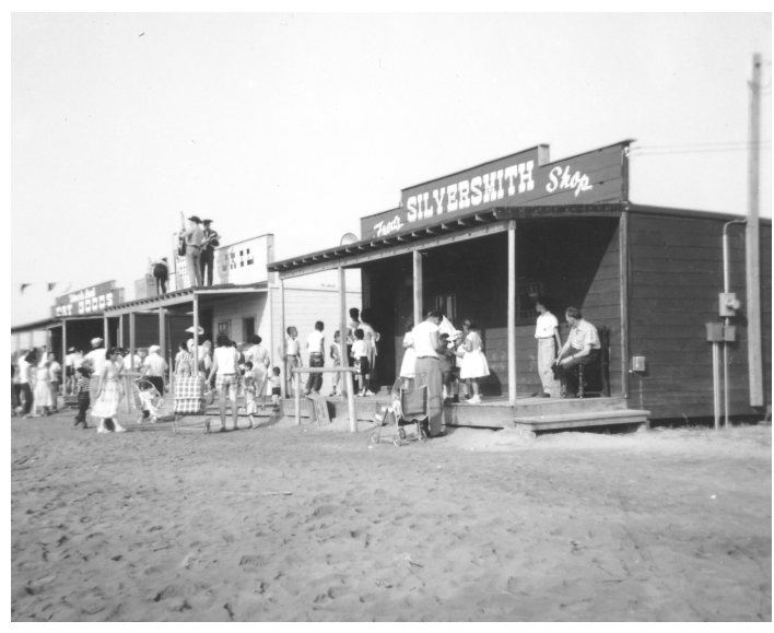
The store section staged "shoot outs", and naturally sold as many souvenirs as possible.