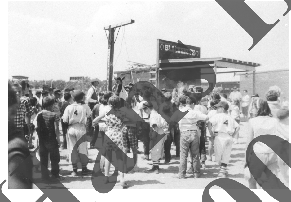
The "hanging" of the bad guy attracts the curious.