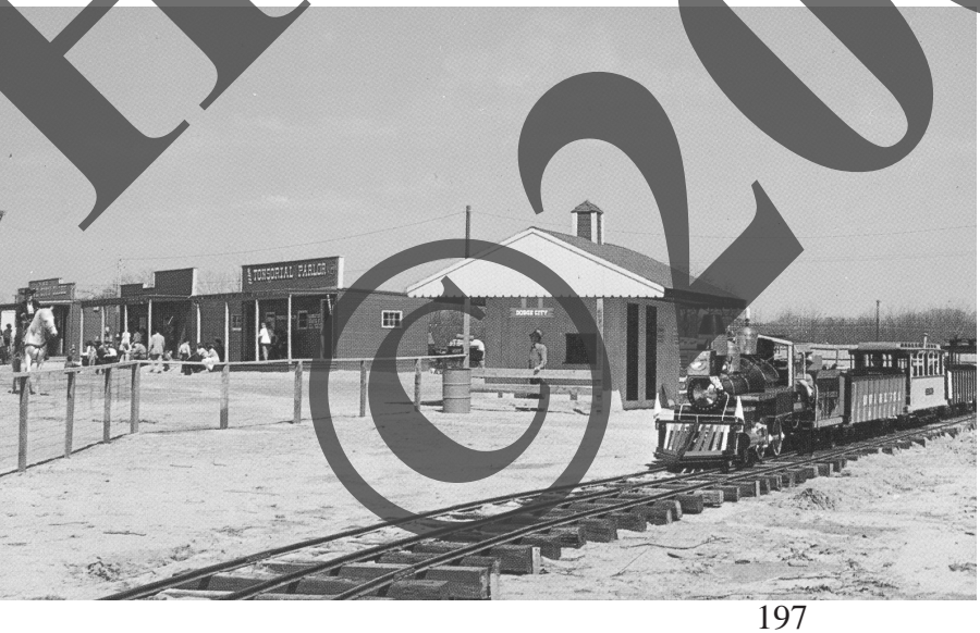
The train ride, a favored of the small folks.