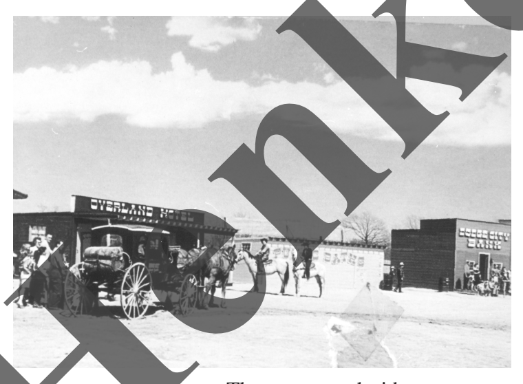
The stage coach ride was a real thrill for the youngsters.