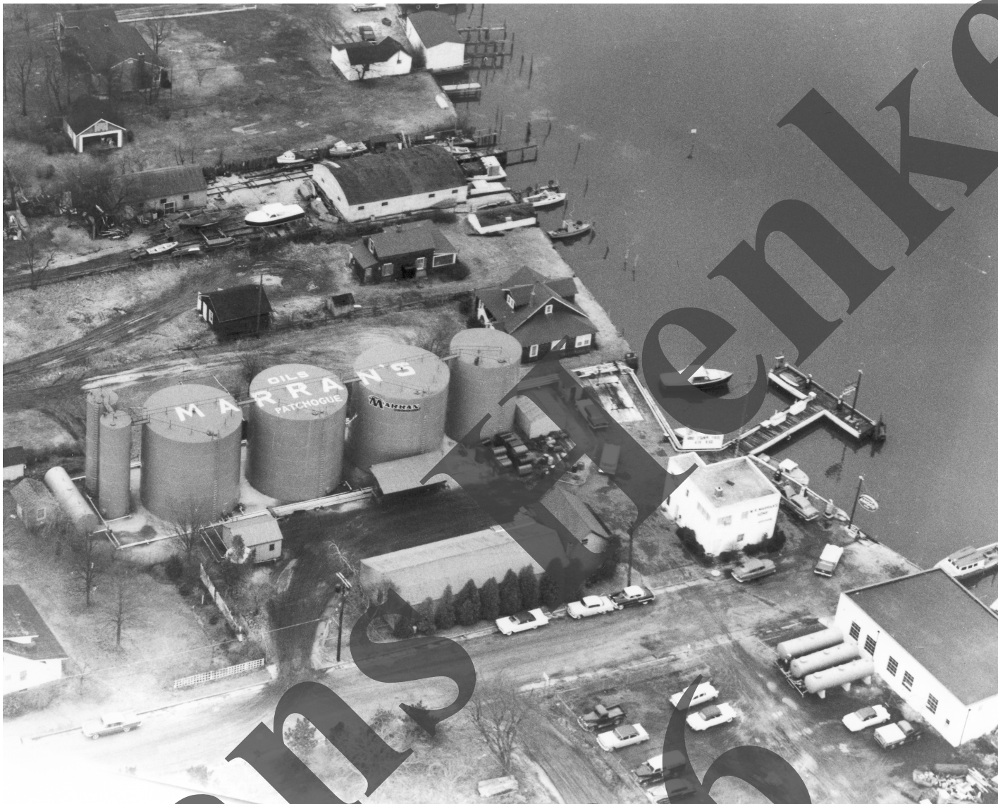
A Jim Mooney Picture