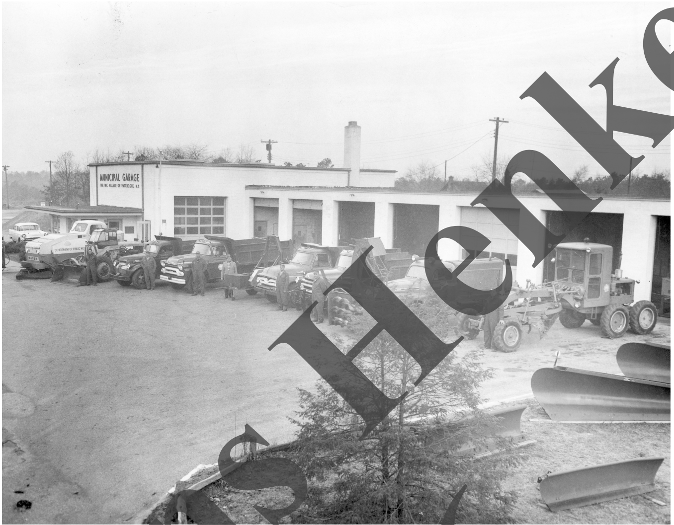
Another picture of the highway department equipment, now in front of the Municipal Garage. The construction of the Municipal Garage on Waverly Avenue started September 7, 1954. The seven bay garage, which cost $59 000, was capable of housing all of the village's equipment.