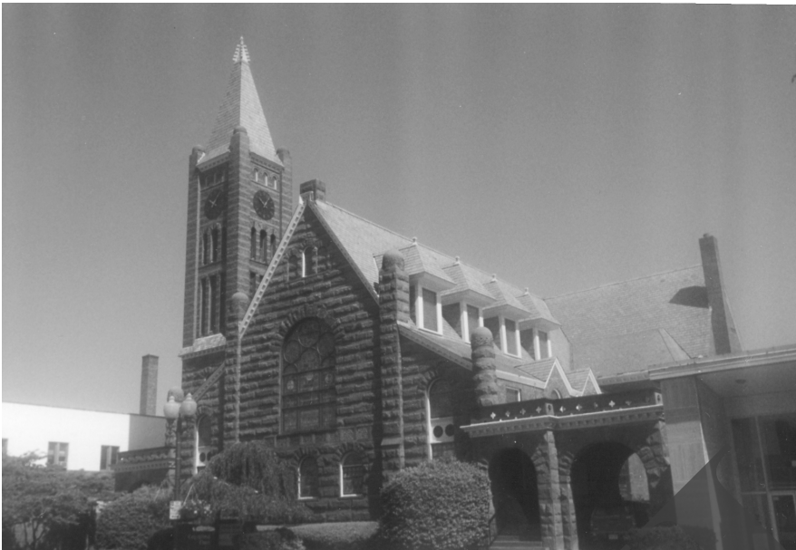
The corner stone of the Congregational Church on East Main Street was laid May 14, 1892, and the dedication of this beautiful church took place on May 14, 1893.