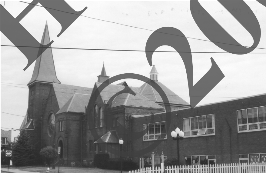
The United Methodist Church, on the southwest corner of South Ocean Avenue and Church Street, was dedicated June 1, 1890, replacing the previous church building on the southeast corner of Church Street and Railroad Avenue.