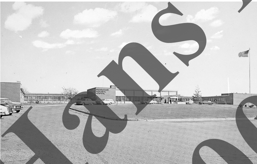
The 96 bed Brookhaven Memorial Hospital, built at a cost of $ 1,300,000, opened August 1, 1956. Patients prior to 1956 had to travel either to Port Jefferson or Bay Shore for treatments in hospitals.