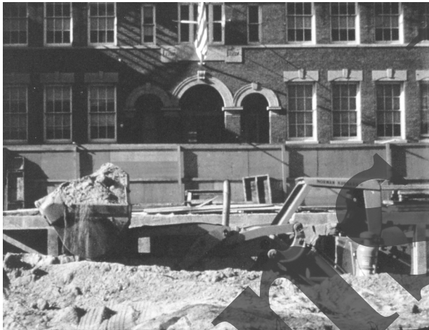
Construction on the new Bay Avenue School started in October, 1963. In this picture a bulldozer is digging out for the foundation of the new school building in front of the old school.