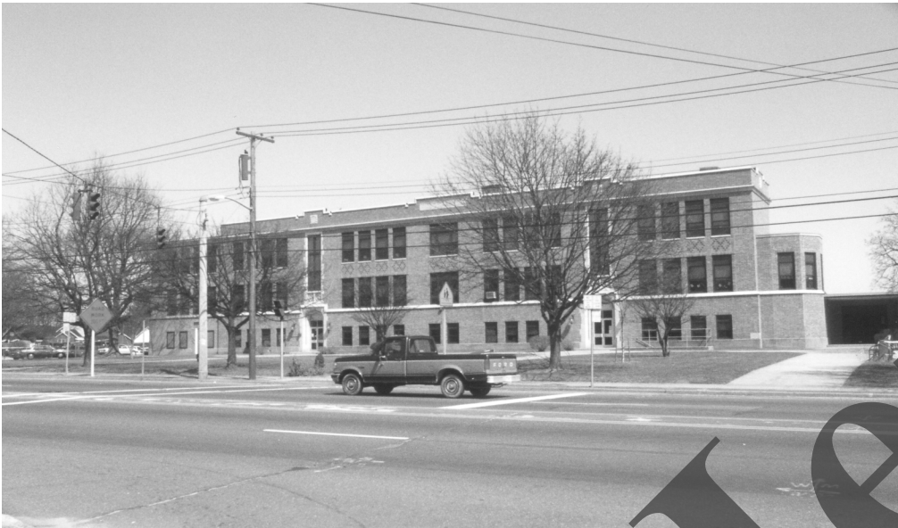
The Medford Avenue Elementary School opened January 5, 1931. There were no changes to the school by the time this picture was taken in 1992, but in 2005 the school was enlarged by an extension on the northeast corner of the building.