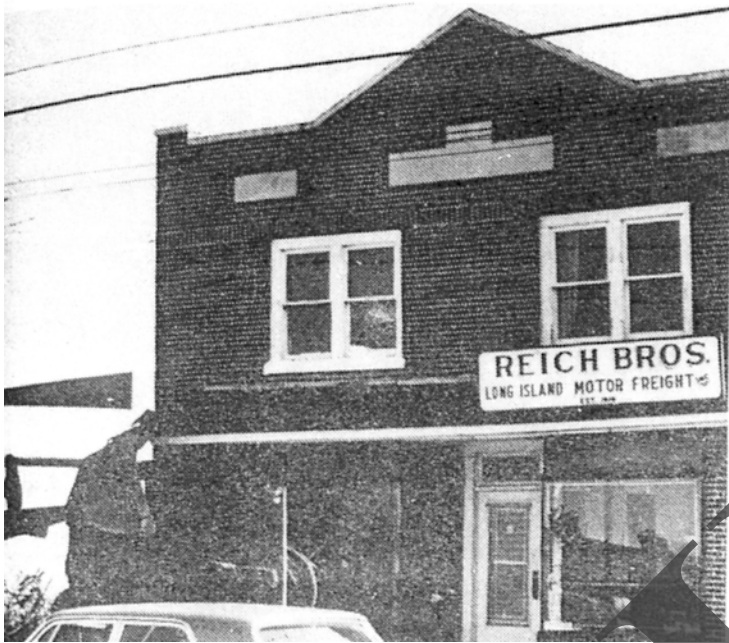
The Reich Brothers Trucking Company office building on the south side of East Main Street, between Evergreen and Grove Avenue, was built in 1928 and demolished in 1981, when the property was sold.