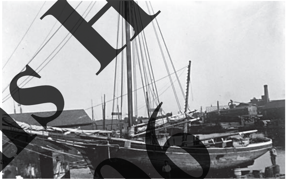
A boat under repair in the Patchogue Harbor.