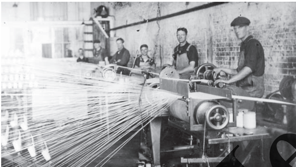
These employees of the lace mill are winding the brass bobbins that would later feed the yarn to the looms.