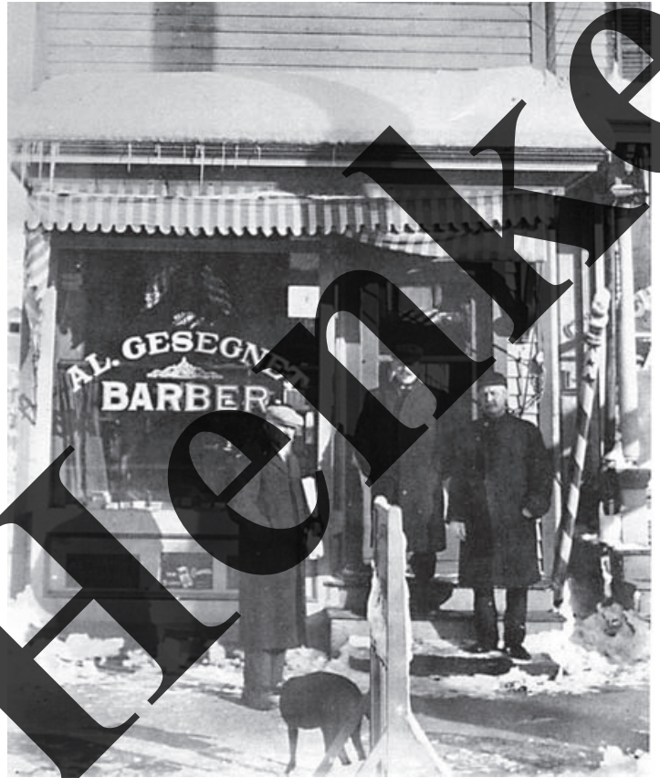
Al Gesegnet's barber shop at 101 West Main Street. The little shop was attached to the large building on the northwest corner of Main Street and Havens Avenue.