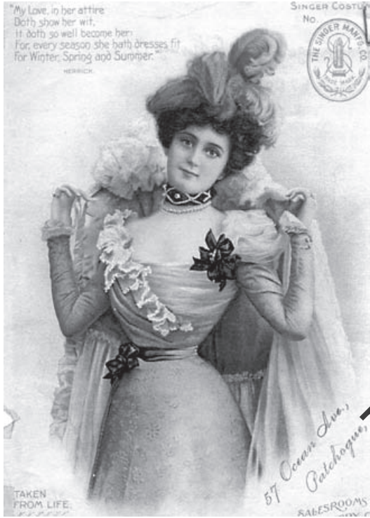
This 1902 advertisement leaflet is from the Singer Machine Company, which had a sales room at 57 South Ocean Avenue.