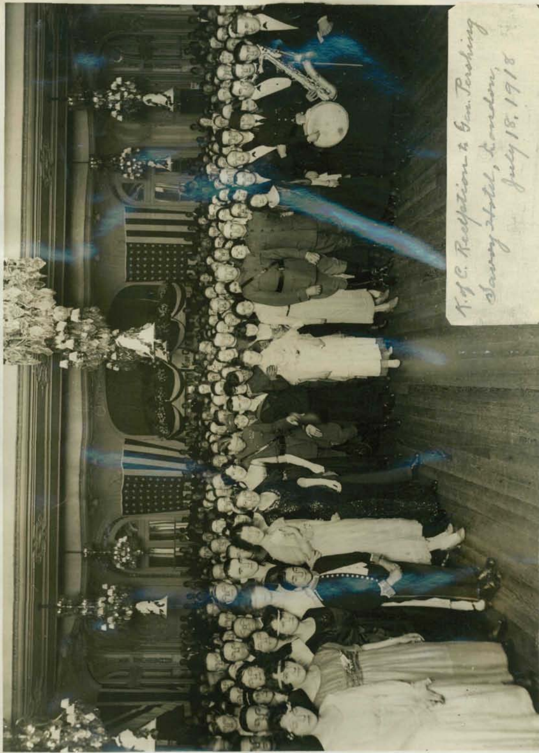
K. of C. Reception to Gen. Pershing Savoy Hotel, London, July 18, 1918