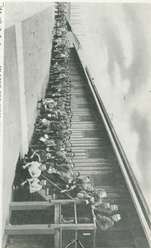
IN LINE FOR MESS, CAMP HOLABIRD, MD.