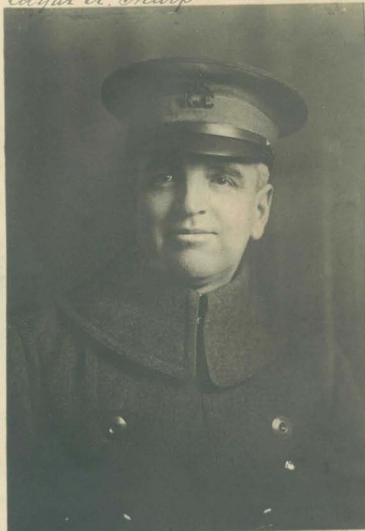
KofC. Commissioner for the British Isles, Headquarters in London - Aug 1918 - Nov. 1919.