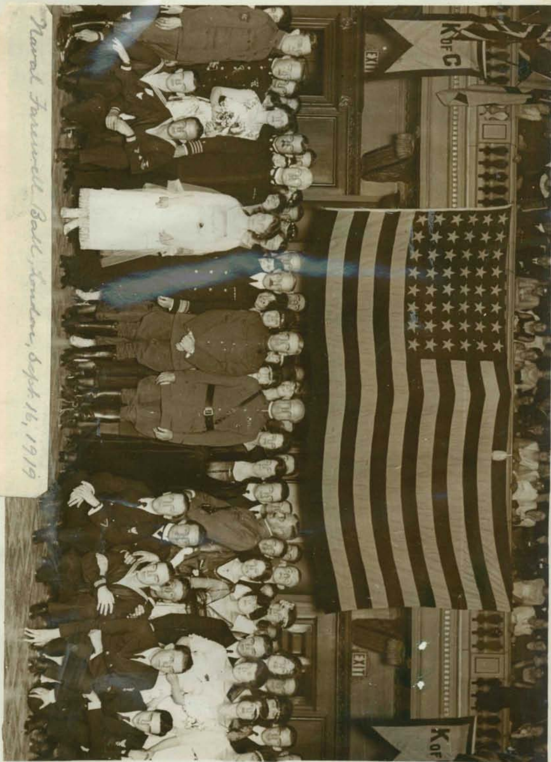
Naval Reserve Battalion, Patchogue, Sept. 16, 1919